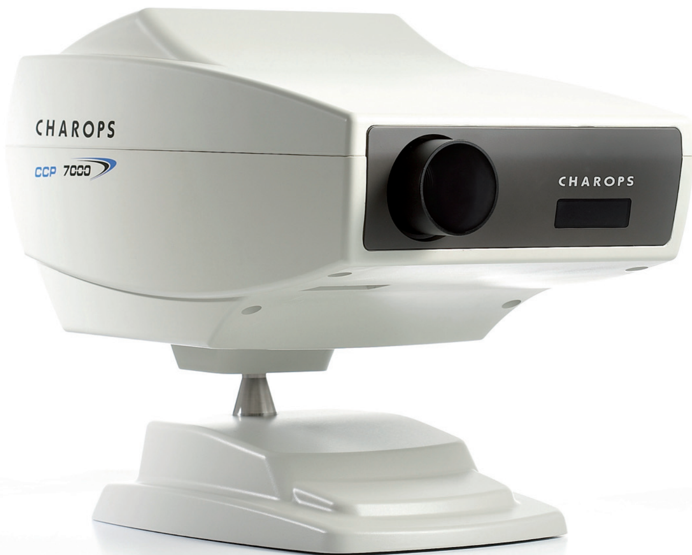
Chart Projector CCP-7000