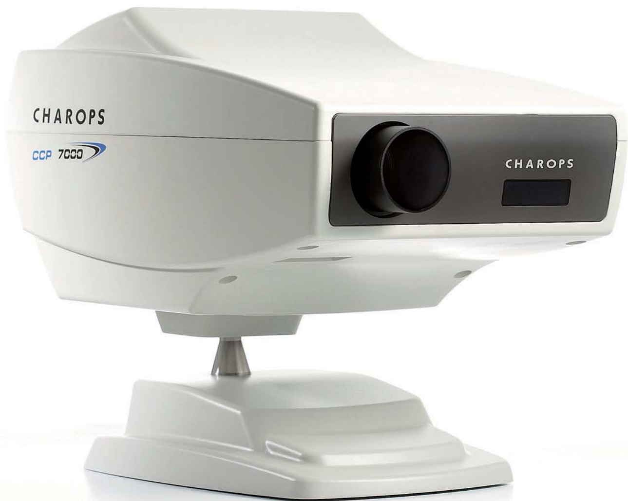
Chart Projector CCP-7000